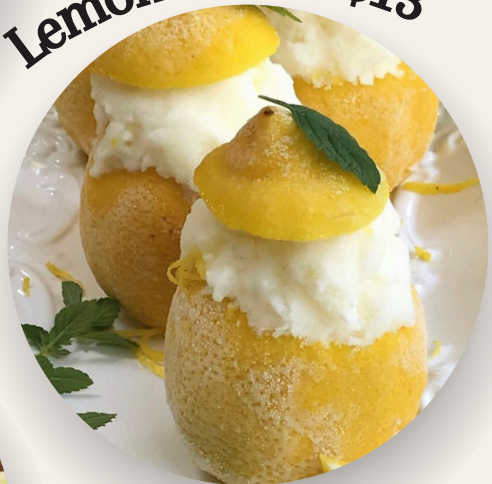
Lemon Sorbet $13